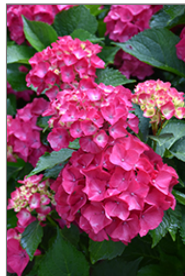
Cityline Paris Hydrangea flowers

Cityline Paris Hydrangea is recommended for the following landscape applications;