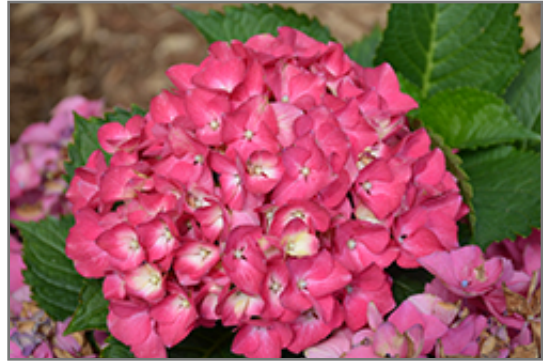
Cityline Paris Hydrangea flowers

Cityline Paris Hydrangea makes a fine choice for the outdoor landscape, but it is also well-suited for use in outdoor pots and containers. Because of its height, it is often used as a 'thriller' in the 'spiller-thriller-filler' container combination; plant it near the center of the pot, surrounded by smaller plants and those that spill over the edges. It is even sizeable enough that it can be grown alone in a suitable container. Note that when grown in a container, it may not perform exactly as indicated on the tag - this is to be expected. Also note that when growing plants in outdoor containers and baskets, they may require more frequent waterings than they would in the yard or garden.