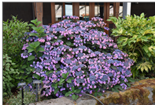
Tuff Stuff Hydrangea in bloom