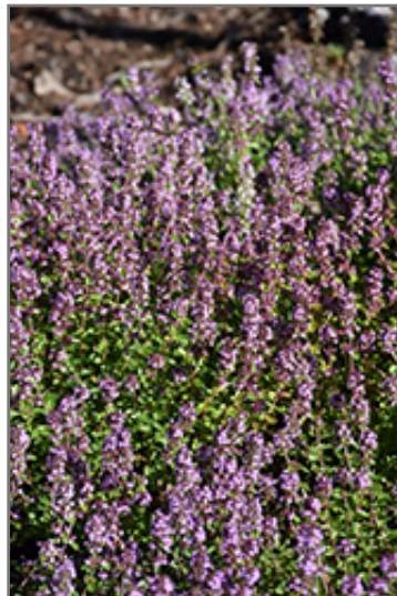
Lemon Thyme flowers