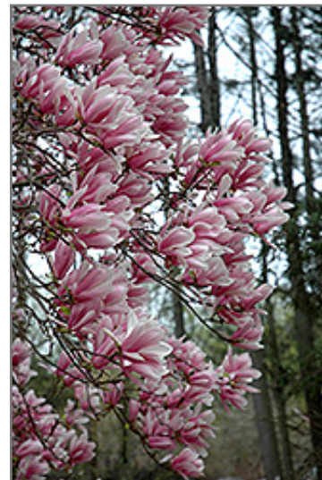
Pink Superba Saucer Magnolia flowers

Pink Superba Saucer Magnolia will grow to be about 25 feet tall at maturity, with a spread of 30 feet. It has a low canopy with a typical clearance of 3 feet from the ground, and is suitable for planting under power lines. It grows at a medium rate, and under ideal conditions can be expected to live for 80 years or more.