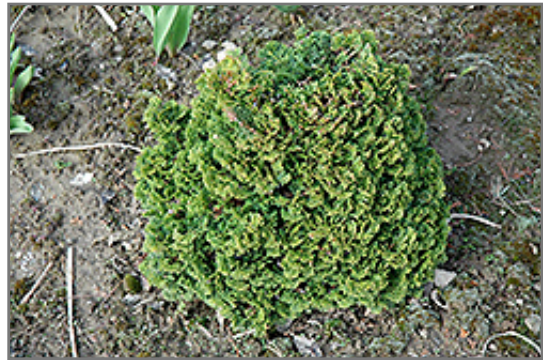
Jean Iseli Hinoki Falsecypress

Jean Iseli Hinoki Falsecypress will grow to be about 24 inches tall at maturity, with a spread of 24 inches. It tends to fill out right to the ground and therefore doesn't necessarily require facer plants in front. It grows at a slow rate, and under ideal conditions can be expected to live for 50 years or more.