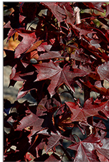
Crimson Sunset Maple foliage