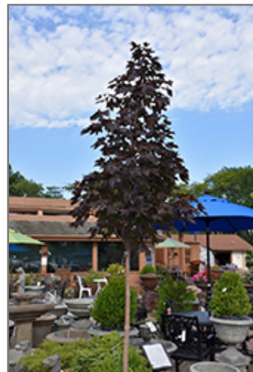
Crimson Sunset Maple