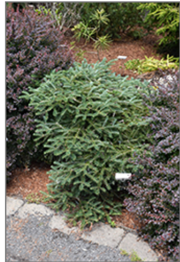
Piccolo Korean Fir

Piccolo Korean Fir will grow to be about 3 feet tall at maturity, with a spread of 3 feet. It tends to fill out right to the ground and therefore doesn't necessarily require facer plants in front. It grows at a slow rate, and under ideal conditions can be expected to live for 50 years or more.