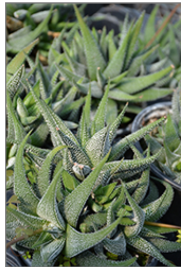
Pearl Plant

When grown indoors, Pearl Plant can be expected to grow to be only 6 inches tall at maturity extending to 12 inches tall with the flowers, with a spread of 4 inches. It grows at a slow rate, and under ideal conditions can be expected to live for approximately 10 years. This houseplant will do well in a location that gets either direct or indirect sunlight, although it will usually require a more brightly-lit environment than what artificial indoor lighting alone can provide. It prefers dry to average moisture levels with very well-drained soil, and may die if left in standing water for any length of time. This plant should be watered when the surface of the soil gets dry, and will need watering approximately once each week. Be aware that your particular watering schedule may vary depending on its location in the room, the pot size, plant size and other conditions; if in doubt, ask one of our experts in the store for advice. It is not particular as to soil type or pH; an average potting soil should work just fine.