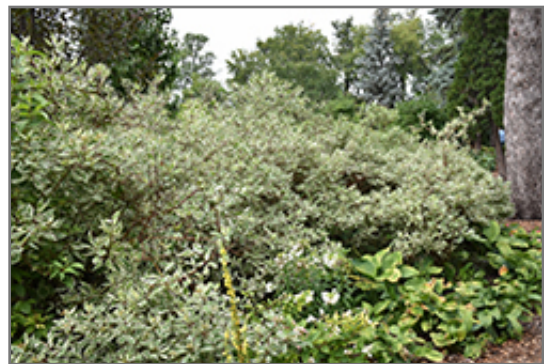
Argenteo Marginata Dogwood