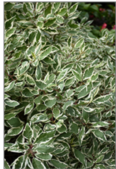
Argenteo Marginata Dogwood foliage

Argenteo Marginata Dogwood is recommended for the following landscape applications;