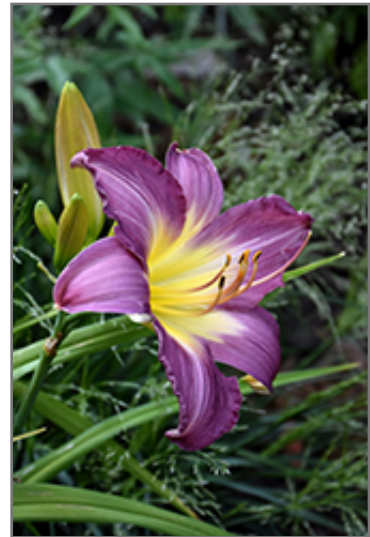
Swirling Water Daylily flowers