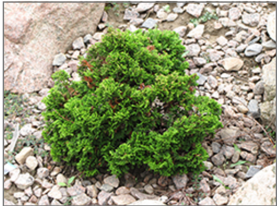
Just Dandy Hinoki Falsecypress

This remarkable little variety features compact sprays of dense, finely textured foliage, on a low, rounded and spreading plant; adds texture to the shrub border or garden; very robust and comparatively faster growing than others in the species