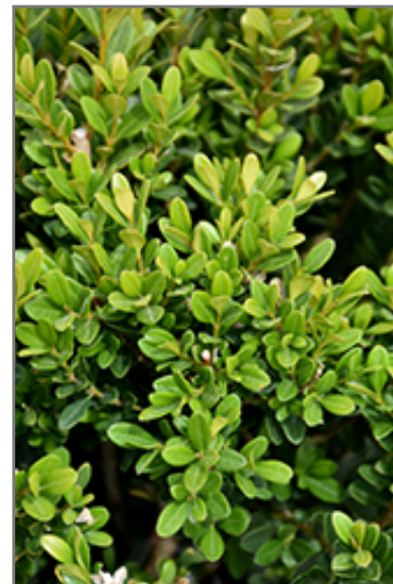
Baby Jade Boxwood foliage