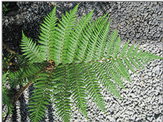
Australian Tree Fern foliage