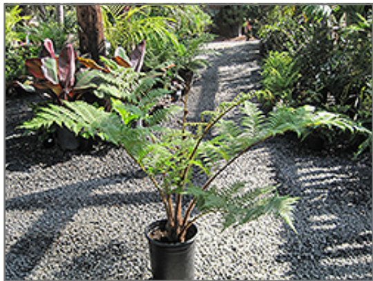
Australian Tree Fern