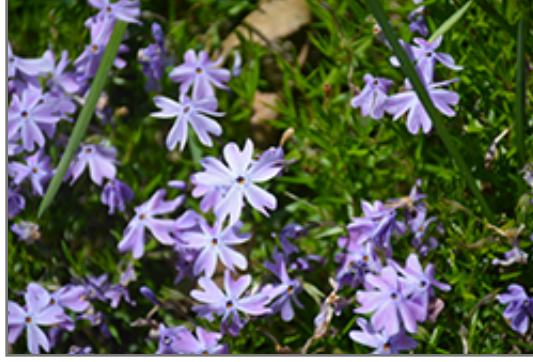
Blue Hills Moss Phlox flowers