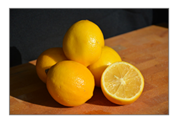
Meyer Lemon fruit and flesh

When grown indoors, Meyer Lemon can be expected to grow to be about 7 feet tall at maturity, with a spread of 6 feet. It grows at a medium rate, and under ideal conditions can be expected to live for approximately 50 years. This houseplant will do well in a location that gets either direct or indirect sunlight, although it will usually require a more brightly-lit environment than what artificial indoor lighting alone can provide. It does best in average to evenly moist soil, but will not tolerate standing water. The surface of the soil shouldn't be allowed to dry out completely, and so you should expect to water this plant once and possibly even twice each week. Be aware that your particular watering schedule may vary depending on its location in the room, the pot size, plant size and other conditions; if in doubt, ask one of our experts in the store for advice. It is particular about its soil conditions, with a strong preference for rich, acidic soil. Contact the store for specific recommendations on pre-mixed potting soil for this plant.