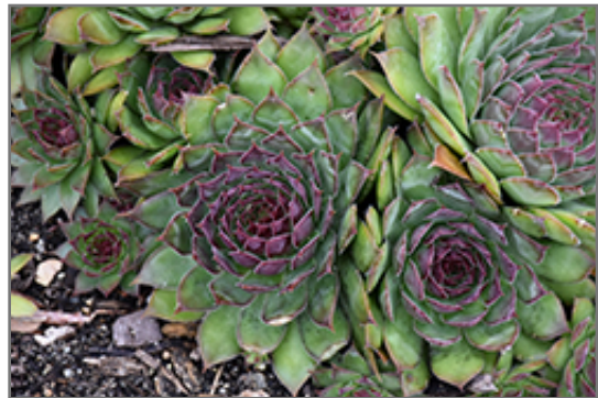
Black Hens And Chicks