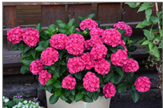
Seaside Serenade Martha's Vineyard Hydrangea in bloom