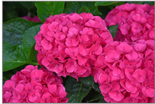
Seaside Serenade Martha's Vineyard Hydrangea flowers

Seaside Serenade Martha's Vineyard Hydrangea is recommended for the following landscape applications;