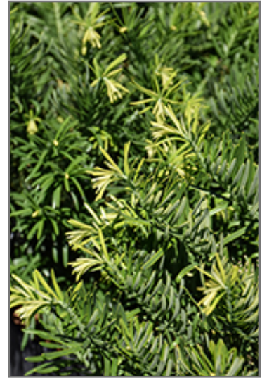
Hedgehog Japanese Plum Yew foliage

* This is a 'special order' plant - contact store for details