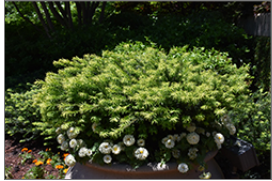
Hedgehog Japanese Plum Yew

Hedgehog Japanese Plum Yew is recommended for the following landscape applications;