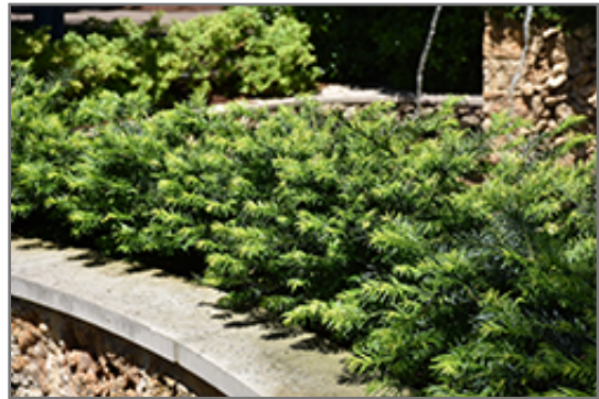
Hedgehog Japanese Plum Yew