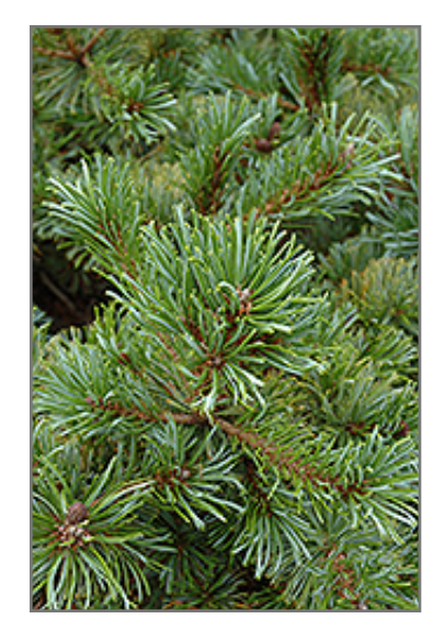
Jeddeloh Japanese Stone Pine foliage