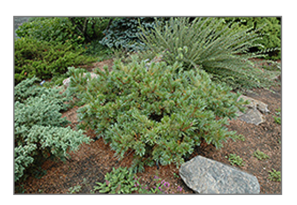
Jeddeloh Japanese Stone Pine

Jeddeloh Japanese Stone Pine is recommended for the following landscape applications;