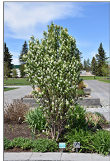
Standing Ovation Saskatoon Berry in bloom