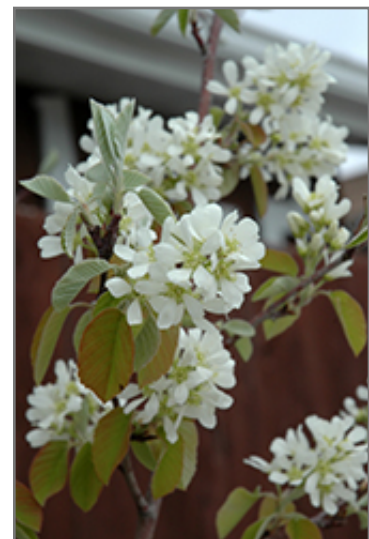
Standing Ovation Saskatoon Berry flowers