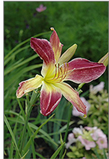
Helter Skelter Daylily flowers