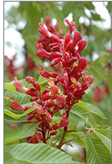
Red Buckeye flowers