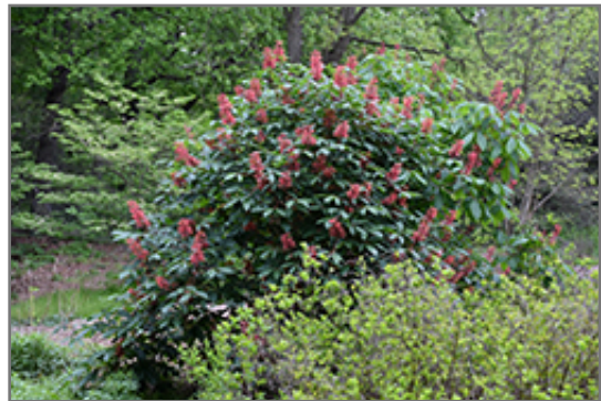
Red Buckeye in bloom