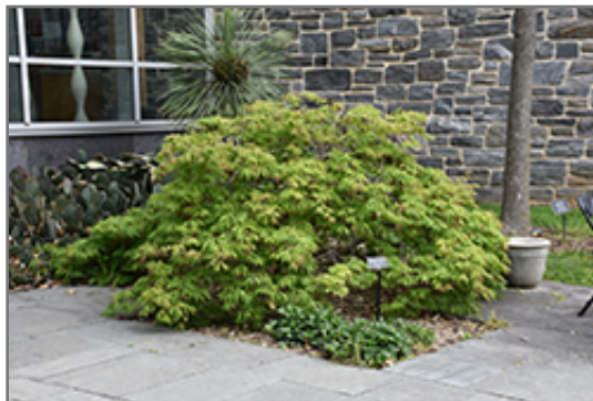
Green Cascade Maple