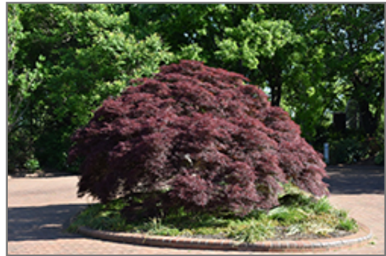
Purple-Leaf Threadleaf Japanese Maple

Purple-Leaf Threadleaf Japanese Maple is recommended for the following landscape applications;