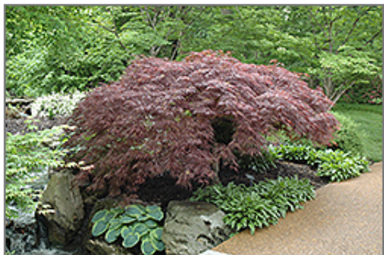
Red Select Japanese Maple