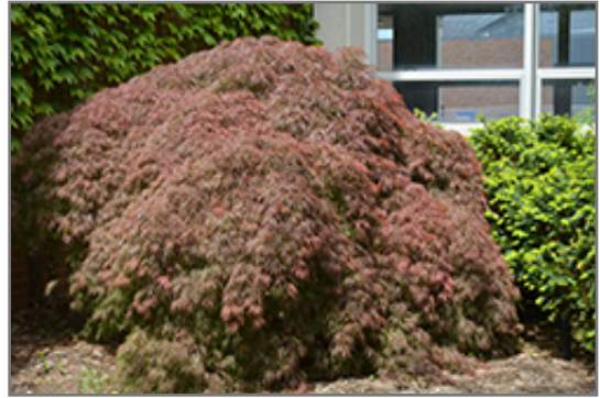
Red Select Japanese Maple

This tree does best in full sun to partial shade. You may want to keep it away from hot, dry locations that receive direct afternoon sun or which get reflected sunlight, such as against the south side of a white wall. It prefers to grow in average to moist conditions, and shouldn't be allowed to dry out. It is not particular as to soil pH, but grows best in rich soils. It is somewhat tolerant of urban pollution, and will benefit from being planted in a relatively sheltered location. Consider applying a thick mulch around the root zone in winter to protect it in exposed locations or colder microclimates. This is a selected variety of a species not originally from North America.