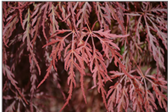
Red Select Japanese Maple foliage

Red Select Japanese Maple is recommended for the following landscape applications;