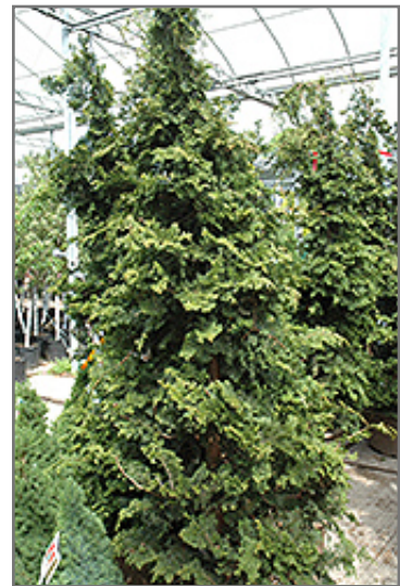
Wells Special Hinoki Falsecypress