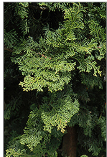
Wells Special Hinoki Falsecypress foliage