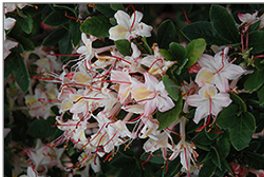
Lollipop Azalea flowers

Lollipop Azalea will grow to be about 3 feet tall at maturity, with a spread of 5 feet. It has a low canopy. It grows at a slow rate, and under ideal conditions can be expected to live for 40 years or more.