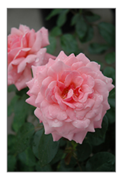
Sexy Rexy Rose flowers