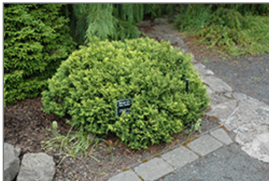
Golden Pin Cushion Falsecypress