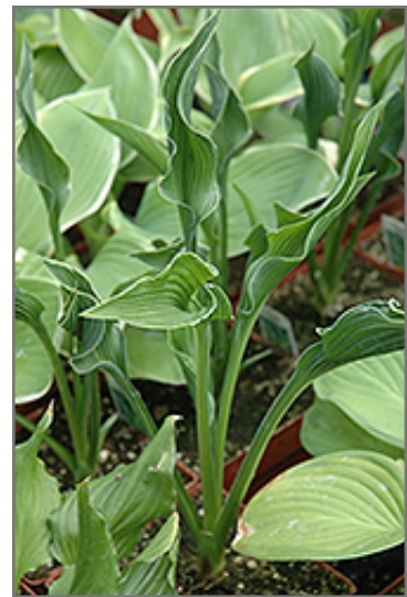
Praying Hands Hosta foliage