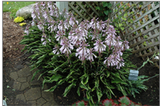
Praying Hands Hosta in bloom

Praying Hands Hosta is recommended for the following landscape applications;