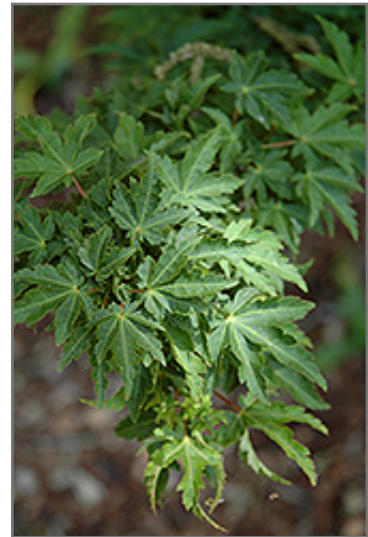
Ojishi Japanese Maple foliage

Ojishi Japanese Maple is recommended for the following landscape applications;