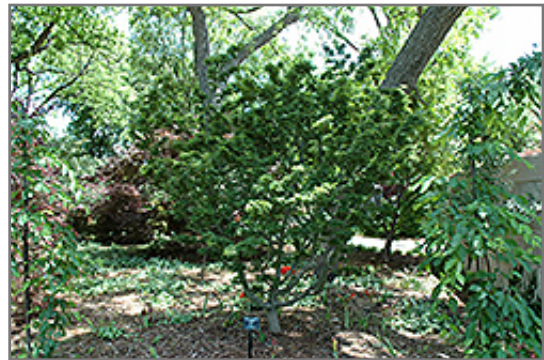
Ojishi Japanese Maple