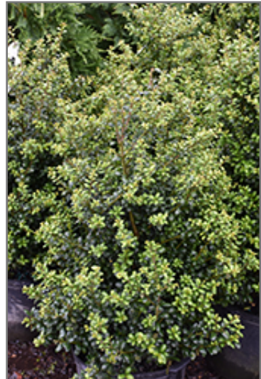
Chesapeake Japanese Holly