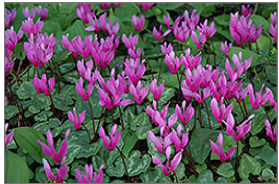
Purple Cyclamen in bloom