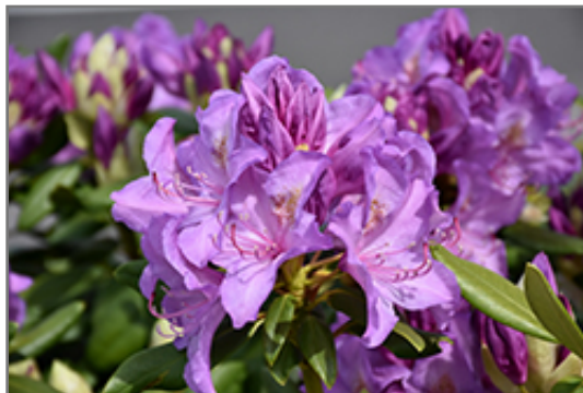
Boursault Rhododendron flowers