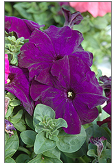
Dreams Midnight Petunia flowers