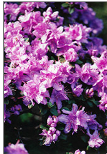
Ramapo Rhododendron flowers