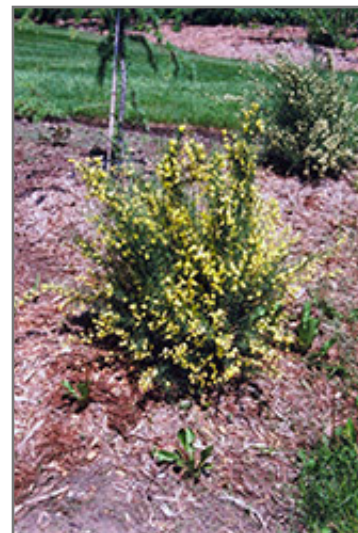
Scotch Broom in bloom