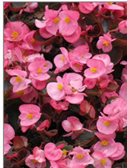
Bada Boom Pink Begonia flowers