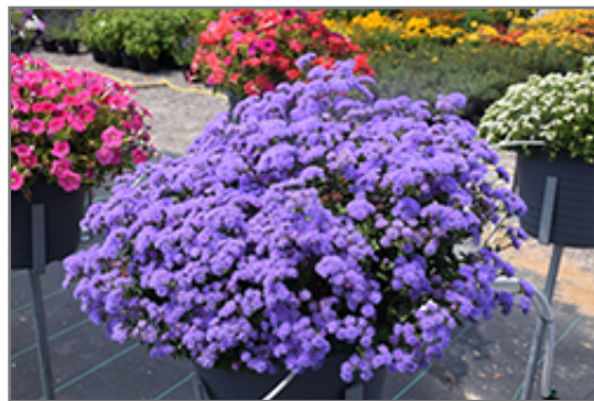
Artist Blue Flossflower in bloom