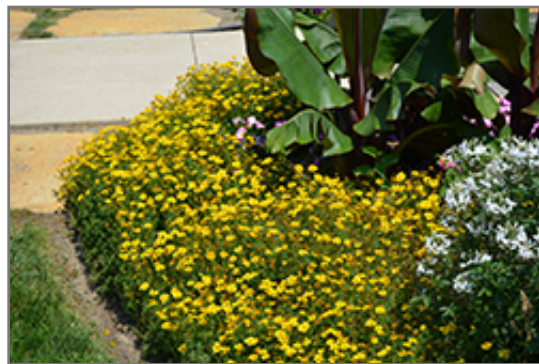
Goldilocks Rocks Bidens in bloom