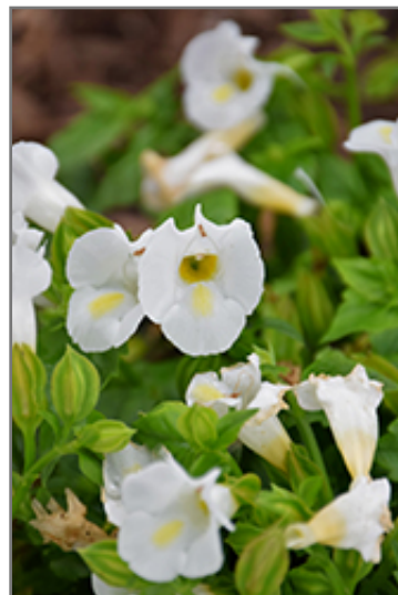
Catalina White Linen Torenia flowers