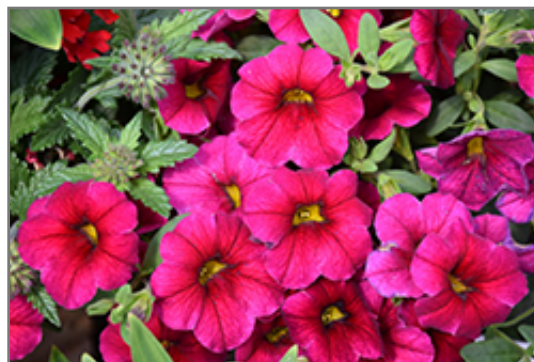
Superbells Cherry Red Calibrachoa flowers