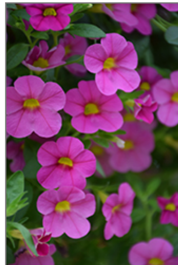
Superbells Pink Calibrachoa flowers

Superbells Pink Calibrachoa is recommended for the following landscape applications;