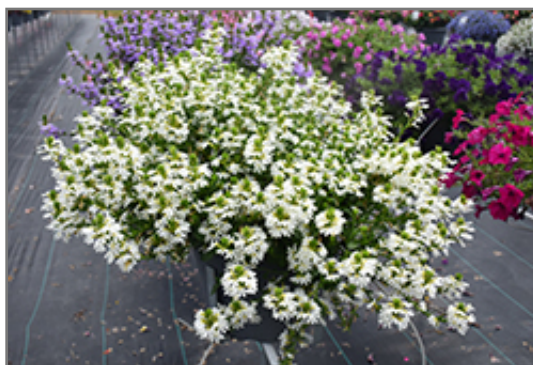
Whirlwind White Fan Flower in bloom