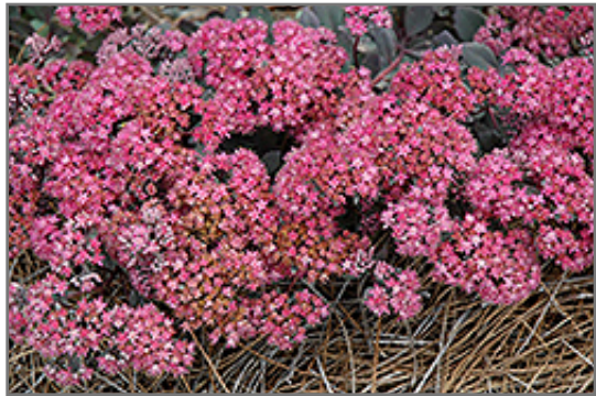
Dazzleberry Stonecrop flowers

Dazzleberry Stonecrop is a dense herbaceous perennial with an upright spreading habit of growth. Its medium texture blends into the garden, but can always be balanced by a couple of finer or coarser plants for an effective composition.