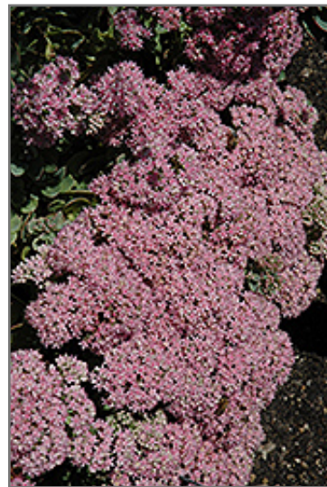
Lime Zinger Stonecrop flowers

This is a relatively low maintenance plant, and is best cleaned up in early spring before it resumes active growth for the season. It is a good choice for attracting bees and butterflies to your yard, but is not particularly attractive to deer who tend to leave it alone in favor of tastier treats. It has no significant negative characteristics.