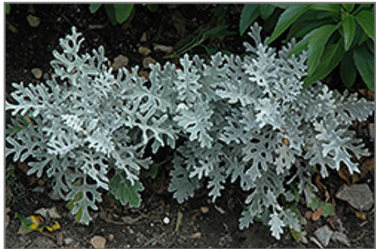
Silver Dust Dusty Miller foliage