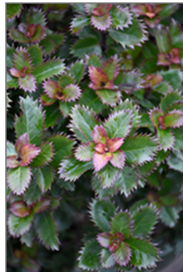
Sallywag Holly foliage