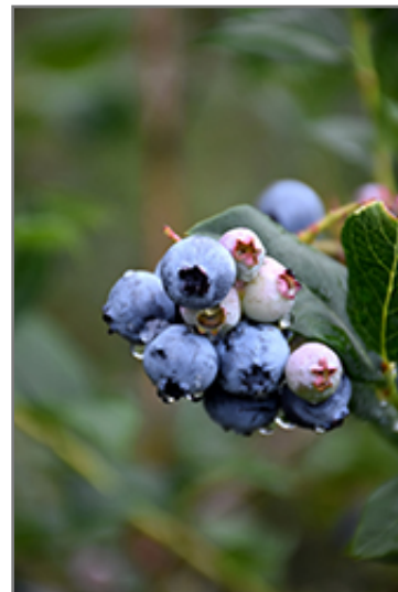
Chippewa Blueberry fruit

Chippewa Blueberry features dainty clusters of white bell-shaped flowers with shell pink overtones hanging below the branches in mid spring. It has green deciduous foliage. The glossy oval leaves turn an outstanding orange in the fall. It features an abundance of magnificent blue berries in mid summer.