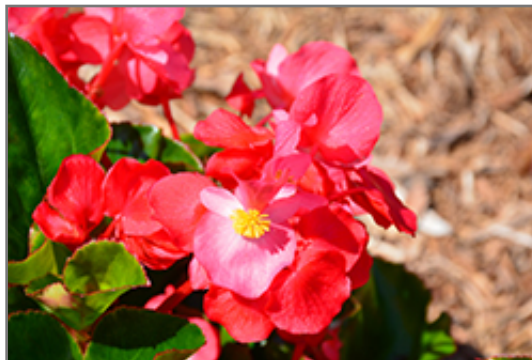
Whopper Rose Green Leaf Begonia flowers

This is a high maintenance plant that will require regular care and upkeep, and usually looks its best without pruning, although it will tolerate pruning. Deer don't particularly care for this plant and will usually leave it alone in favor of tastier treats. Gardeners should be aware of the following characteristic(s) that may warrant special consideration;